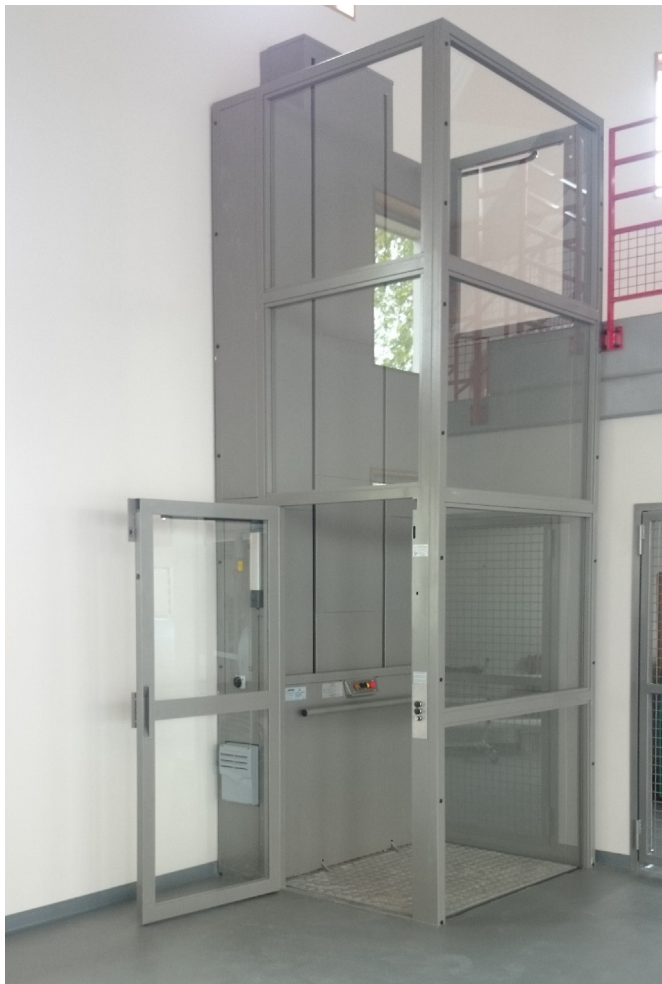
Glas shaft with steel or aluminium frame as an option