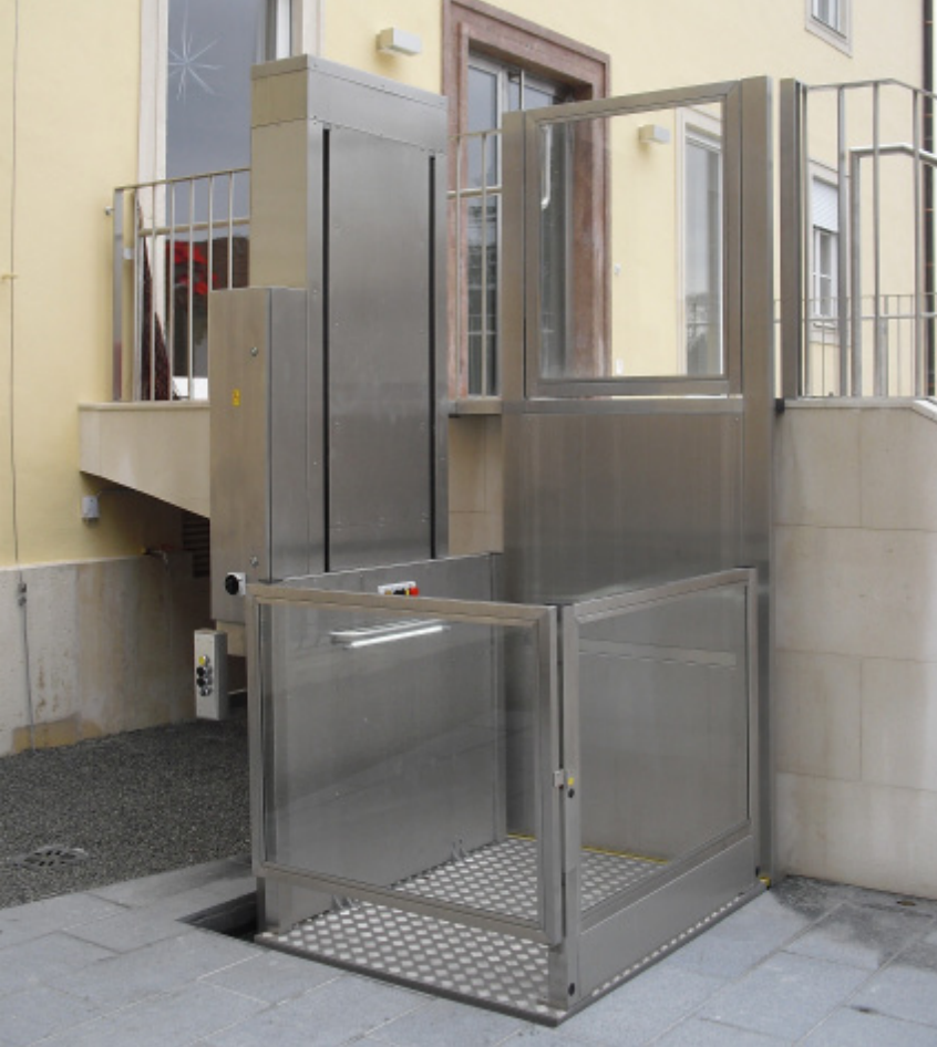
Lift with 70mm pit and execution in stainless steel