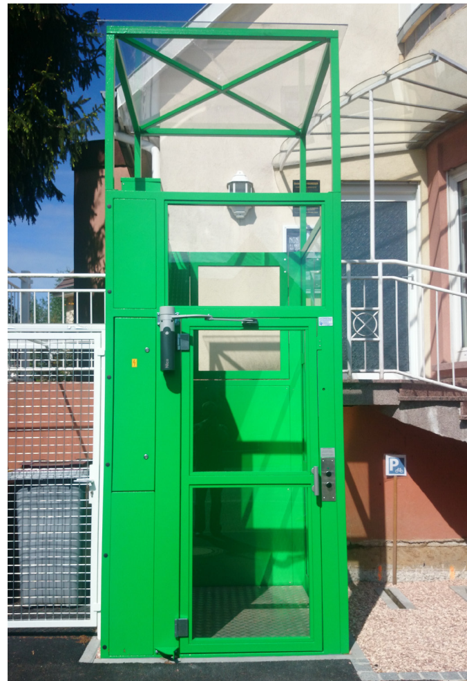
Glas shaft with roof and special colour

Especially designed for outside installation, the double-chain drive and the robust electrics provide for a safe drive and a low-maintenance operation.