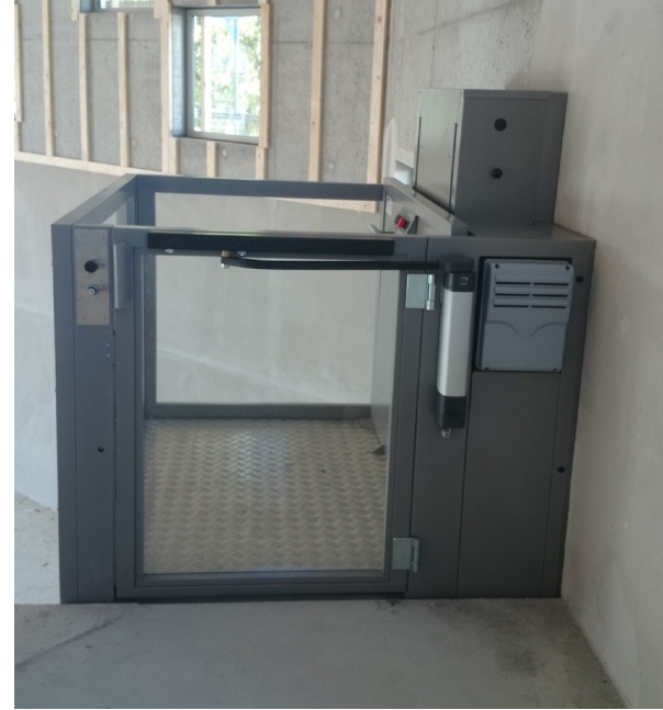
Upper gate can be manual or automatic